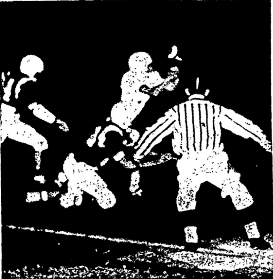
GO, KEARNEY, GO. The referee raises his arms in the traditional TD signal as Kearney High opens its 26-0 Color Day bombing of Norfolk with a Kirk Melson touchdown shot from close range.

goal try with a second to go in a 26-0 win. The Bears raised his arms in the traditional TD signal as Kearney High opens its 26-0 Color Day bombing of Norfolk with a Kirk Melson touchdown shot from close range.